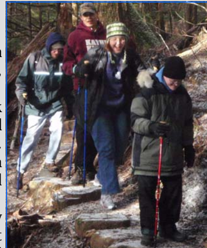
Ketchikan ORCA hiking club on the Rainbird trail, building skills for a long trip this summer.

ORCA co-sponsored very successful disability mentoring days in Ketchikan and Juneau. Employment opportunities and career paths were examined and individuals explored their dream jobs. A successful placement in Ketchikan resulted in a job offer for at least one ORCA consumer. Overall, 2008 was a great year for ORCA. It was filled with fun, challenges and fantastic successes!