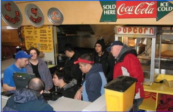
The RecWorks! group gets a lesson on how to make pizzas at Bullwinkle's in Juneau.

RecWorks!, a grant-funded pilot project designed to demonstrate that participation in recreation can build pre-employment and ultimately long-term employability skills, got off the ground this year. The motto of the program is "From Enjoyment to Employment." The RecWorks! Philosophy is that positive recreational opportunities build confidence and myriad skills, thereby enhancing an individual's prospects for employment matches.